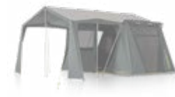
Atlas Roof Cover