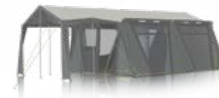
Titan Roof Cover